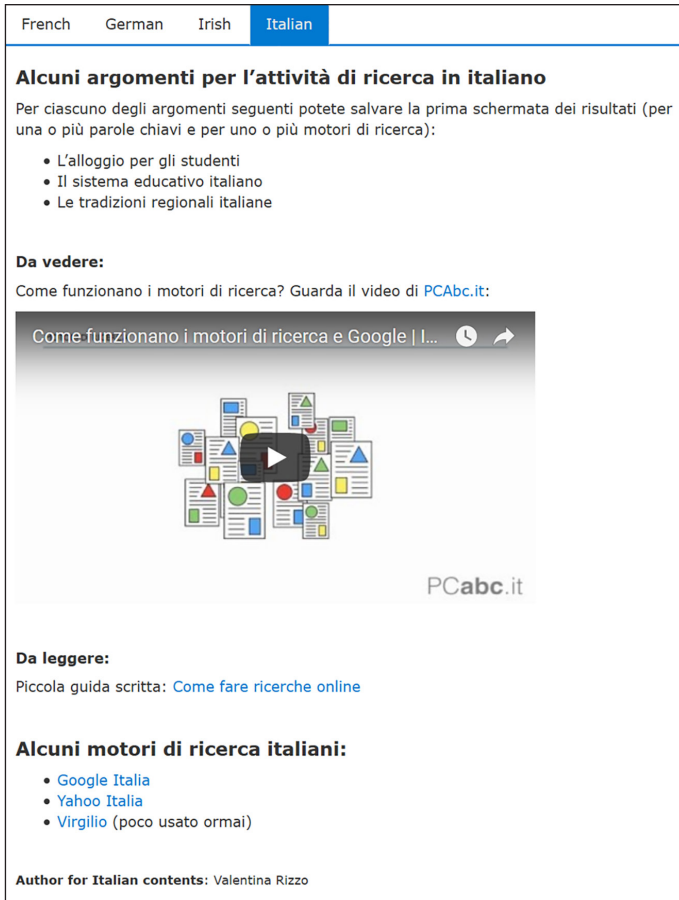
Figure 4. Localisation of Let's search! for Italian